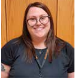
Bethany Bridge Elementary Teacher Aide