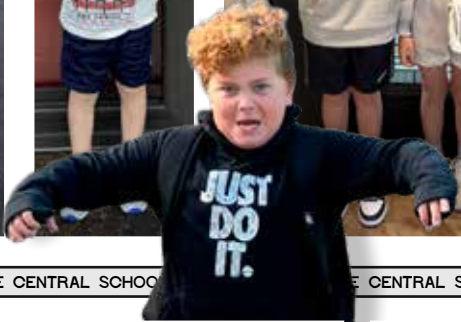
WELLSVILLE CENTRAL SCHOOL DISTRICT WELLSVILLE CENTRAL SCHOOL DISTRICT WELLSVILLE CENTRAL SCHOOL DISTRICT WELLSVILLE CENTRAL SCHOOL DISTRICT