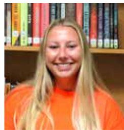
Hailey Keppner Middle School Physical Education